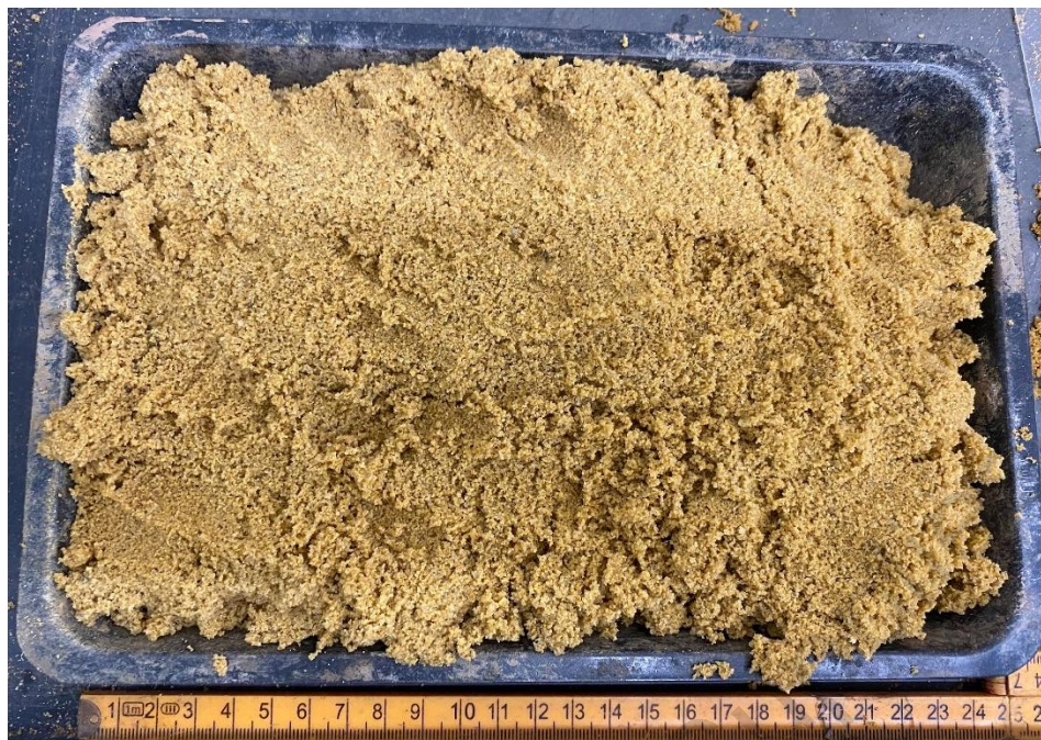
Plate 1: Kent Medium / Coarse Contract Sand Sample