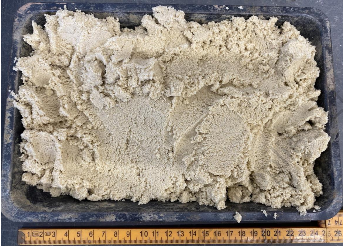
Plate 1: Fine / Medium Silica Washed Sand (R) Sample