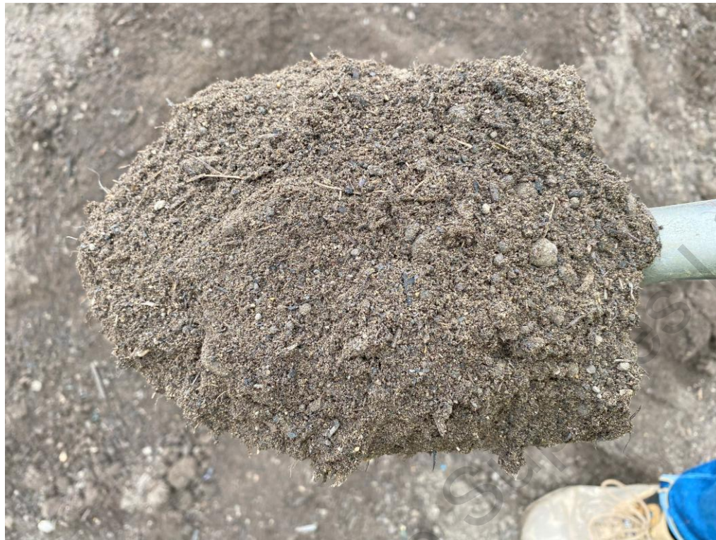
Plate 1: Sample GP10 Plus Topsoil (S)