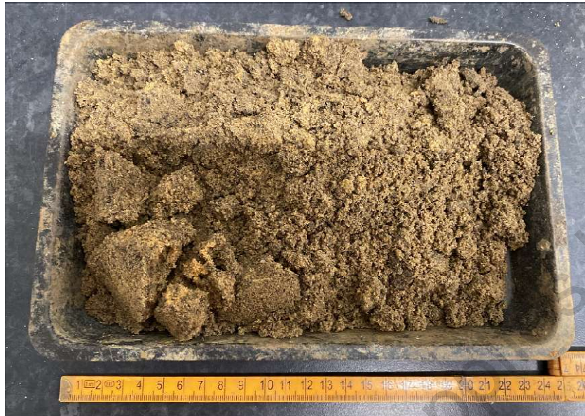
Plate 1: Urban Tree Soil (S) Sample