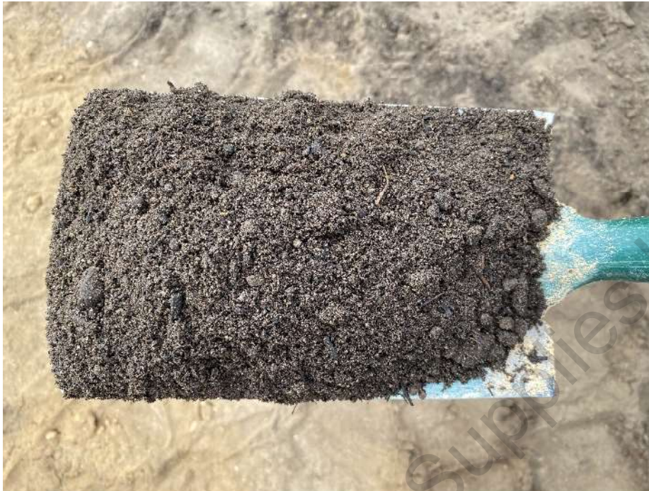
Plate 1: Sample GP10 Plus Topsoil (S)